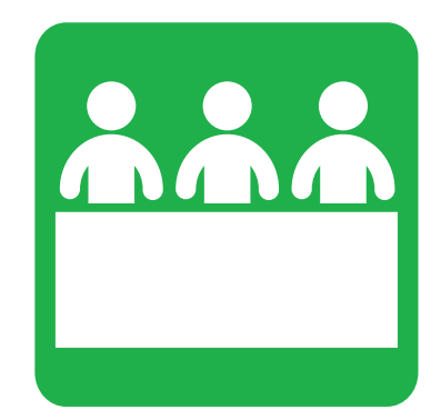
FREE USE OF THE CONFERENCE ROOM